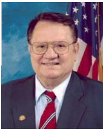
Paul E. Gillmor