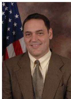
Zachary T. Space

Athens County (part) Belmont County (part) Carroll County Coshocton County Guernsey County Harrison County Hocking County Holmes County Jackson County Knox County Licking County (part) Morgan County Muskingum County Ross County (part) Tuscarawas County Vinton County