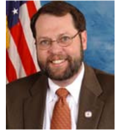
Steven C. LaTourette